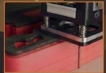
CNC Foam Fabrication